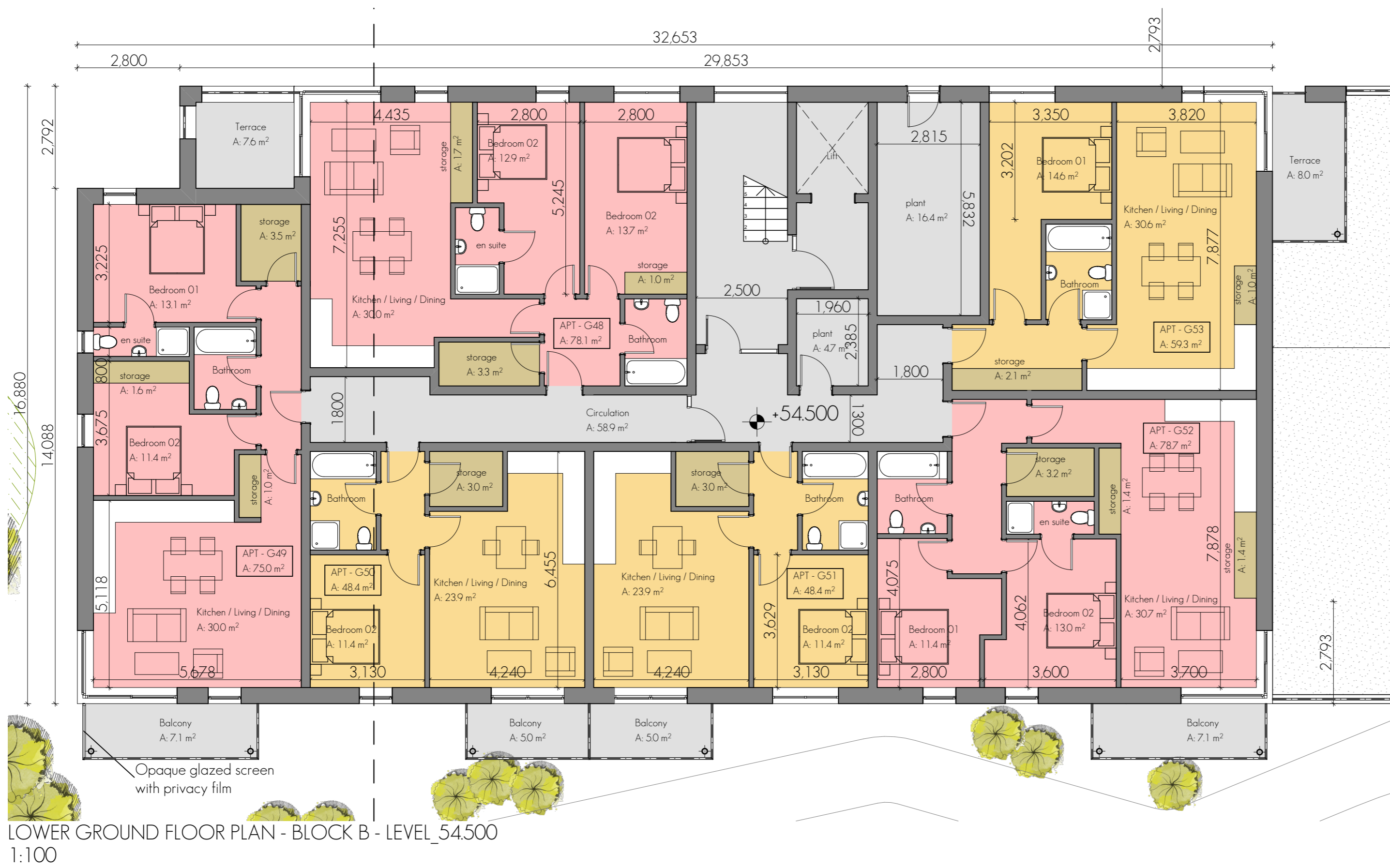
LOWER GROUND FLOOR PLAN - BLOCK B - LEVEL +54.500 1:100