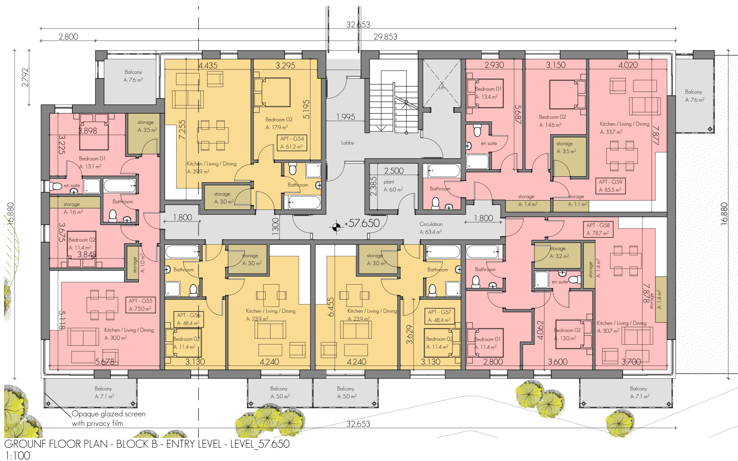
GROUND FLOOR PLAN - BLOCK B - ENTRY LEVEL - LEVEL +57.650 1:100